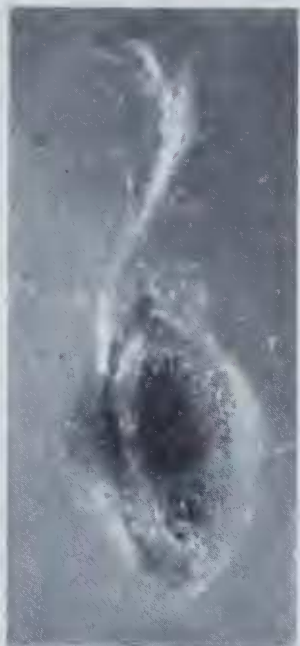
Fig. 1. Fruit of Schoenus capillifolius (Holotype), showing one of the six hypogynous bristles fully extended.